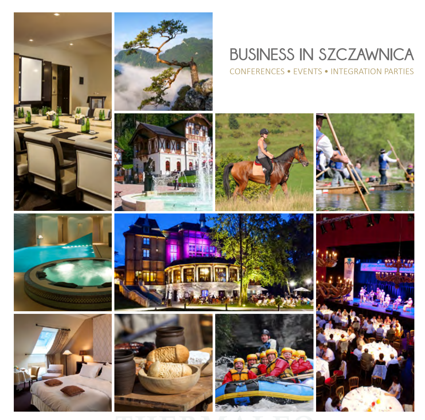
Grupa Thermaleo & Uzdrowisko Szczawnica